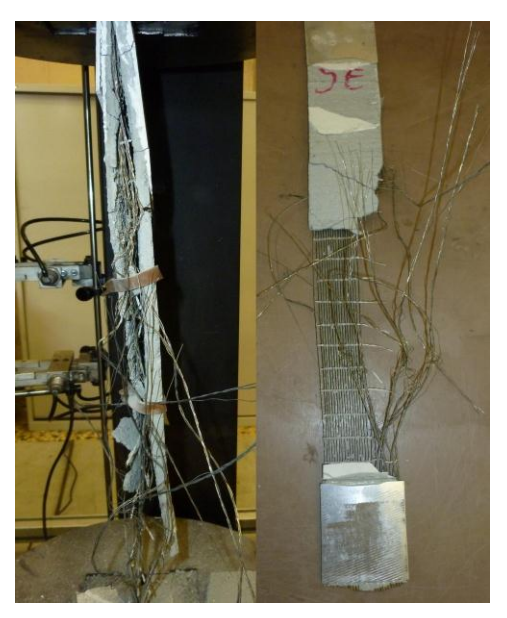
Figure 7: Splitting of the FRCM steel fibre net specimen

Instead the test of the FRCM composite with steel fibres provided good results. It has been observed the opening of several transversal cracks in the cementitious matrix (Figure 6), followed by the sudden failure of the steel strands (Figure 7). Although the cementitious matrix has been properly designed for FRCM applications, steel strands were very close one to each other and probably the penetration of the matrix into the fibres was poor. As a matter of fact some longitudinal splitting phenomena have been observed (Figure 7). The average ultimate load value was of 45945 N, whereas the maximum stress was of 3293 MPa.