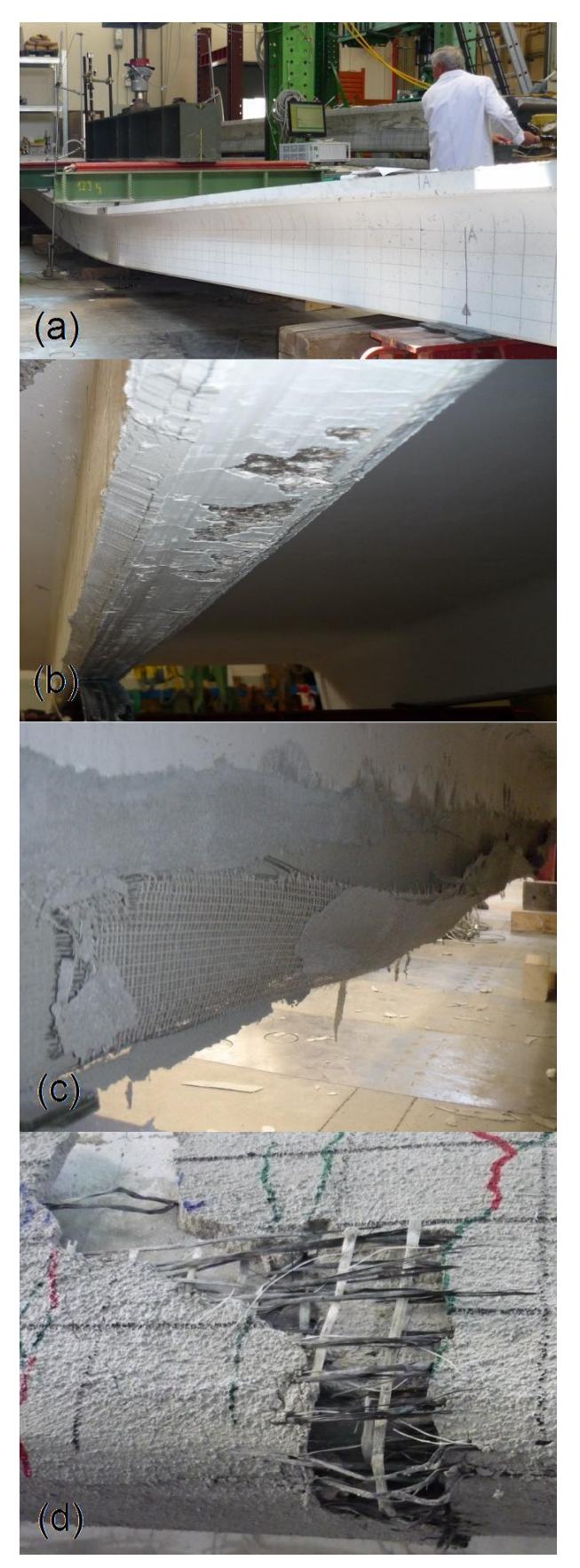
Figure 2: Failure of the beam TT00 (a), TTcl (b), TTsf (c), and TTcf (d).