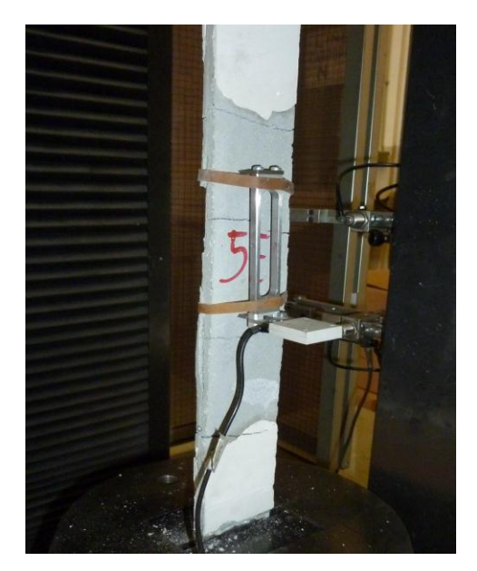
Figure 6: Cracking of the FRCM specimen with steel fibres.

In order to perform a better clamping of the specimens without inducing premature cracking, the concrete at both ends of the specimens was removed for about 40mm and the external fibres were bonded to two